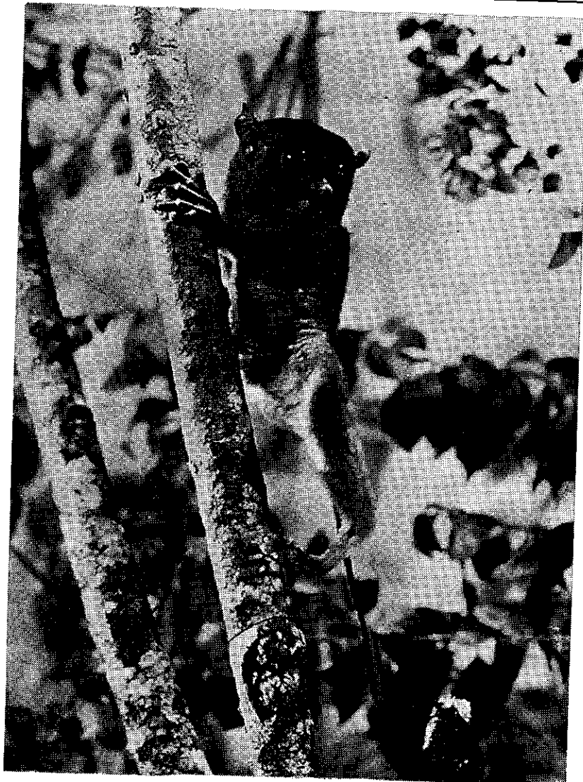
Tarsius claiming his territory

The Journal of the Malayan Nature Society