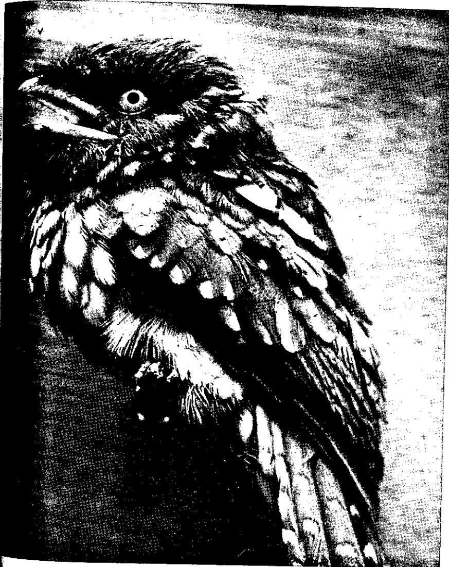
Gould's Frogmouth ( Batrachostomus Stellatus )

The Journal of the Malayan Nature Society.